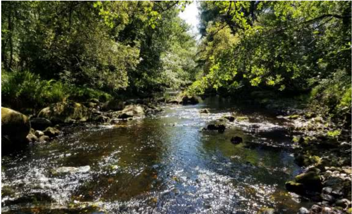
Inchavore River, Oldbridge, Co. Wicklow

The Waters of LIFE is an EU LIFE Integrated Project (IP) which aims to help reverse the deterioration of Ireland's most pristine waters.