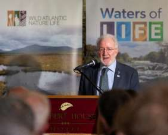
Malcom Noonan TD, Minister of State for Heritage and Electoral Reform launching the Waters of Life project

Following the official launch by Minister Noonan, attendees were taken on field trips in the local area.