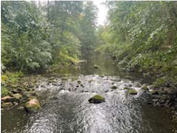
Kiskonjoki river at Latokartanonkoski, Finland

The Waters of LIFE Project was invited to attend a workshop entitled: “Workshop on EU LIFE Integrated Projects - What did we learn?” in Helsinki, Finland, from 12th – 14th September 2022. 49 participants from 46 LIFE Integrated Projects from 22 countries from across the EU related to various themes were represented at the workshop.