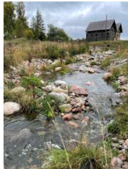
Natural fish pass on the Kiskonjoki river at Kosken Kartano, Finland.

The workshop was organised by the Ministry of the Environment of Finland. Its aim was to document what issues that LIFE Integrated Projects (IP’s) from around the EU had encountered, to discuss them in a workshop and to synthesise the results into a report which would be sent to the LIFE programme administrators in order to make improvements to the running of LIFE IP’s.